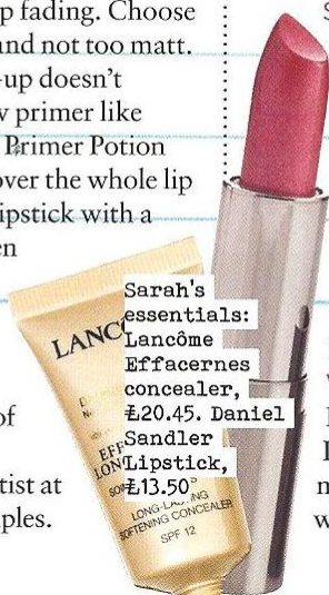
Sarah's essentials: Lancôme Effacernes concealer, £20.45. Daniel Sandler Lipstick, £13.50

Readers' most common question is what eye-shadow colours to choose. Any advice? Do you want a natural or dramatic look? For a natural style, choose a soft taupe eye shadow with a chocolate eyeliner, or a soft pink eye shadow with a grey liner. For a dramatic look, avoid black as it can look harsh in photos. Opt for light grey eye shadow with a dark grey eyeliner instead. Use black mascara to intensify the eyes; brown just isn't strong enough. How can a bride ensure her make-up lasts all day without it looking plastered on? Start with a clear primer to prevent your complexion make-up fading. Choose a foundation that's light and not too matt. To ensure your eye make-up doesn't crease, use an eye-shadow primer like Urban Decay Eyeshadow Primer Potion (£14.50). Apply lip liner over the whole lip area, then three coats of lipstick with a brush, blotting in-between with a tissue, with a dot of gloss over the top. What's the biggest mistake brides make? Wearing the wrong type of foundation. Get colour-matched by a make-up artist at a counter and ask for samples.